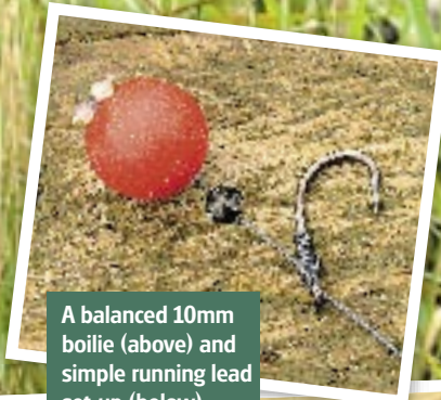
A balanced 10mm boilie (above) and simple running lead set-up (below).