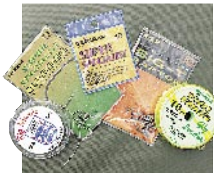
Low-diameter hooklinks and small hooks.

Size 10 specialist pattern hooks are ideal, especially if you fish them in conjunction with fine hooklinks, such as a low-diameter braid or